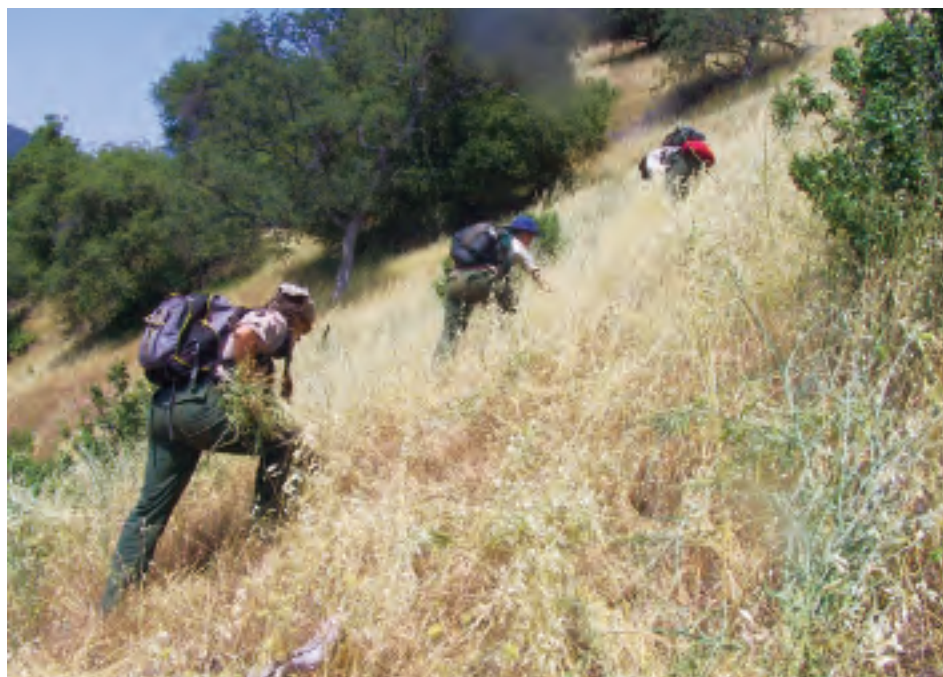
The Nation Park Service's Exotic Plant Management Team removes satellite infestations of Centaurea solstitialis (yellow starthistle) to prevent the plant's spread.