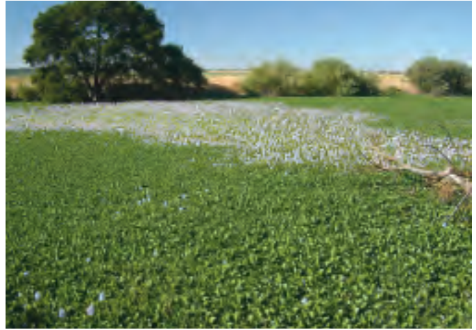
Dense mats formed by aquatic plants such as water hyacinth ( Eichhornia crassipes ) reduce habitat for waterfowl and fish.

Complete description of criteria system and detailed plant assessments available at www.cal-ipc.org .