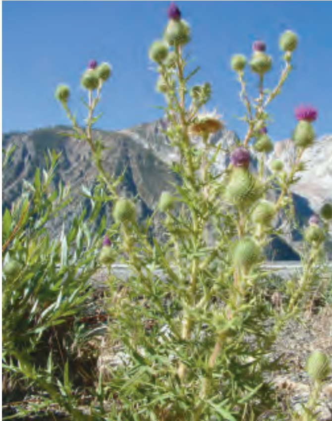
Cirsium vulgare (bull thistle) is spreading at high elevations, such as in Yosemite National Park.