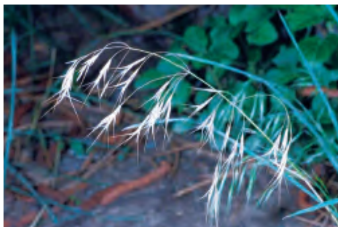
When Bromus tectorum (downy brome or cheatgrass) replaces native perennial grasses, the frequency of wildfires shortens from 60-100 years to 3-5 years.

The core of the Inventory is Table 1, which lists those plants we have categorized as invasive plants that threaten California wildlands.. The types of information contained in Table 1 is described below.