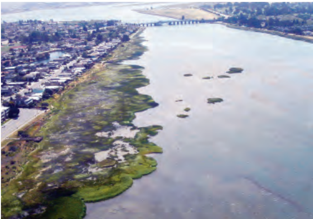
Circular clones of Spartina alterniflora x foliosa (smooth cordgrass hybrid) spread in San Francisco Bay.

(Affiliations for identification purposes only)