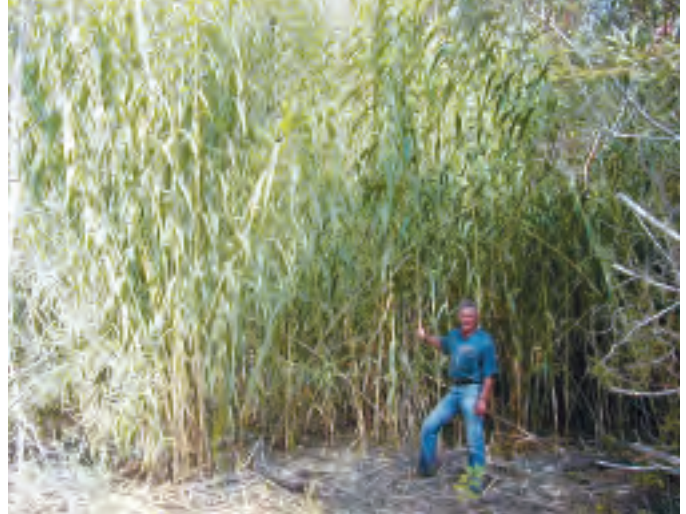
In the past 15 years, approximately $15 million has been spent statewide to control Arundo donax (giant reed) in California.

It is important to note that every species listed in Table 1 is invasive, regardless of its overall rating, and should be of concern to land managers. Although the impact of each plant varies regionally, its rating represents cumulative impacts statewide. Therefore, a plant whose statewide impacts are categorized as Limited may have more severe impacts in a particu-