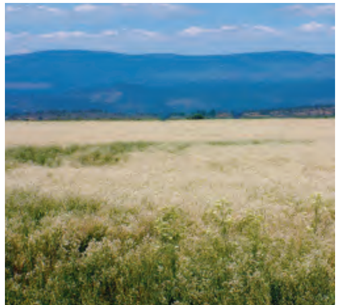
Lepidium latifolium (perennial pepperweed or tall whitetop) concentrates salt in marsh soils, threatening several rare plant species.