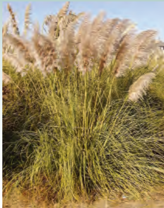
Pampasgrass ( Cortaderia selloana ) displaces native plant communities in coastal habitats. (Photo by Bob Case, California Native Plant Society).