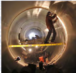
Welding the Lake Hodges Pipeline