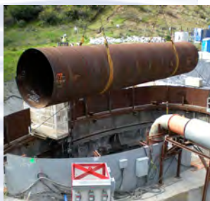
50-foot segment for the San Vicente Pipeline