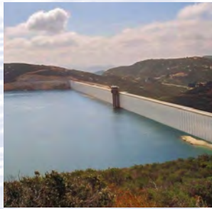
The Olivenhain Dam and Reservoir